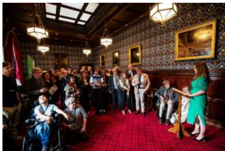
13 May Jubilee Room, Parliamentary Reception to celebrate 150 Years of Alexandra Palace