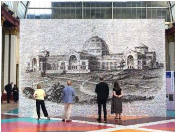
Unveiled on 23 May: By The People: 150 Lifetimes (by artist Helen Marshall, founder of The People's Picture ) Funded by The National Lottery Heritage Fund .