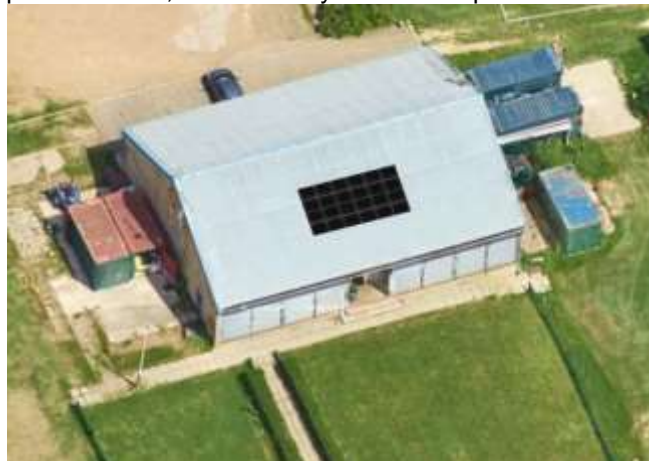
Figure 1. The Sports Pavilion, indicative layout of solar panels

3.6 The Council have confirmed that the project will require planning permission. A planning application is being prepared alongside this report. The committees are asked to consider the project and provide any comments of advice to the Board. Individual members will also be able to comment on the application through the planning process.