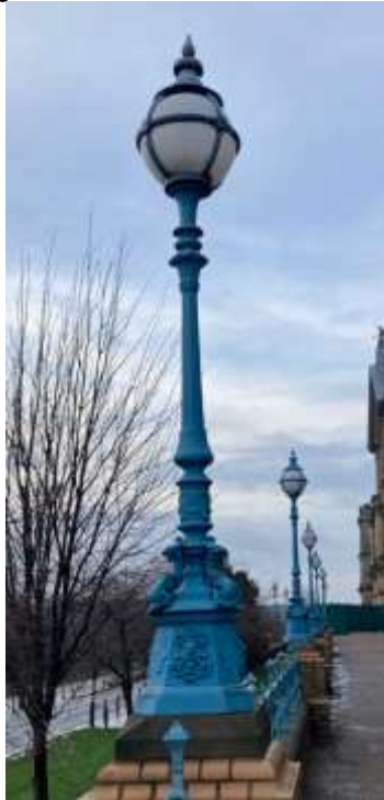
Figure 2, example South Terrace lighting column

3.9 The new lamps require half as much power as the originals and it's been estimated that they will save 7,370 kWh of electricity a year. This saves emissions of 1.65 tonnes of CO 2 e a year.